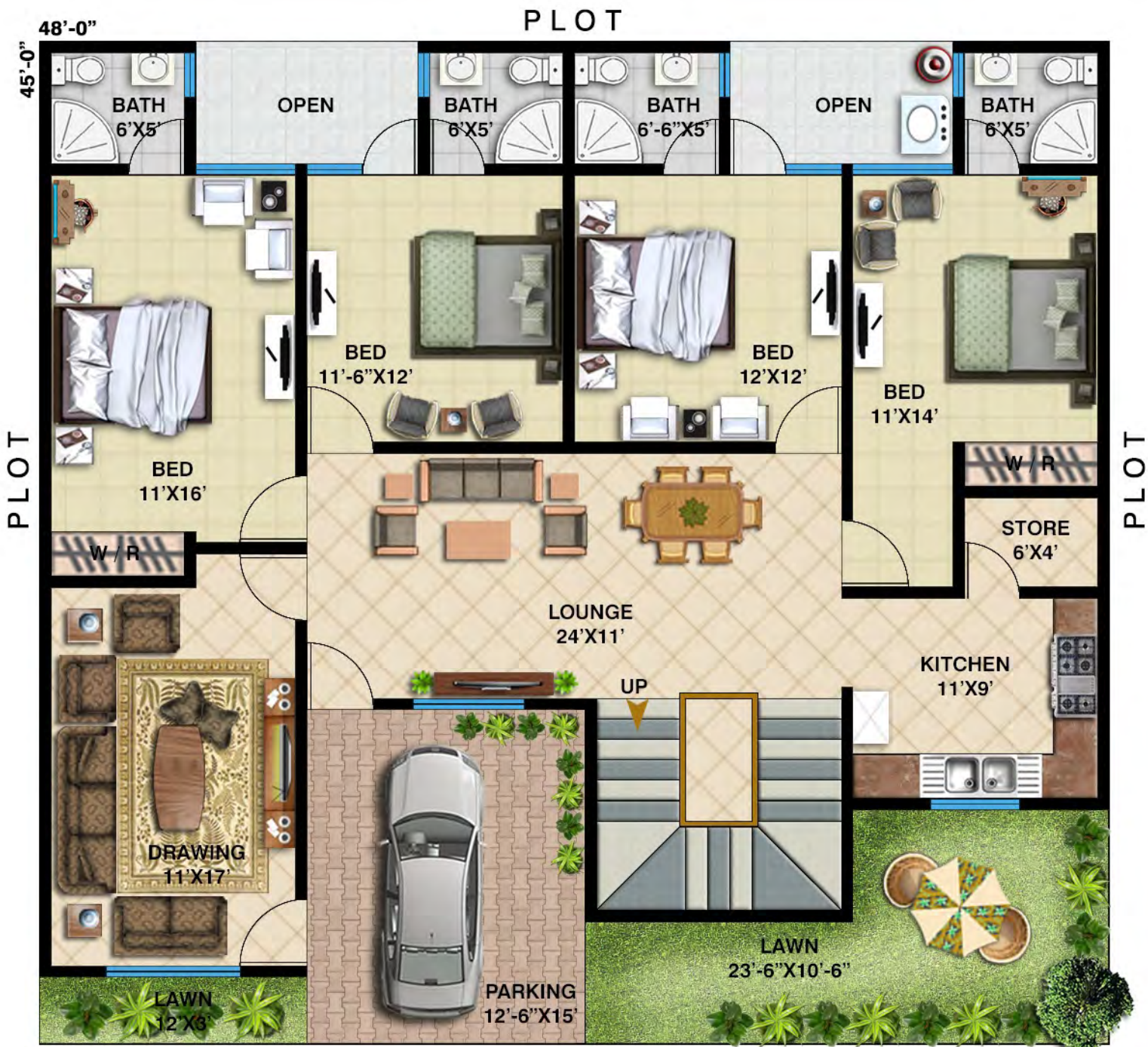
GROUND FLOOR PLAN ROAD